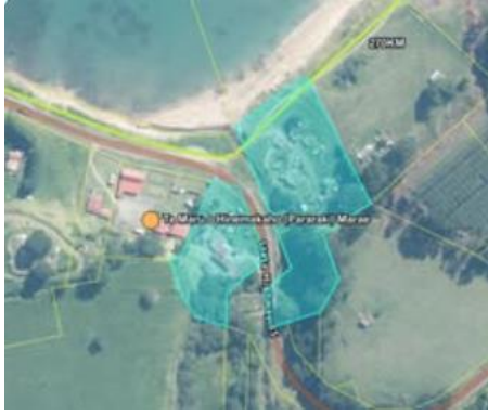
TE POITO 3B ML 8954 BLK IV WHANGAPARAOA SD